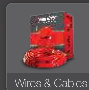
Wires & Cables