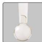
Metallic pearl white