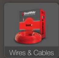
Wires & Cables