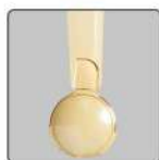
Metallic pearl ivory