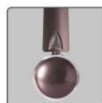
Metallic slate grey